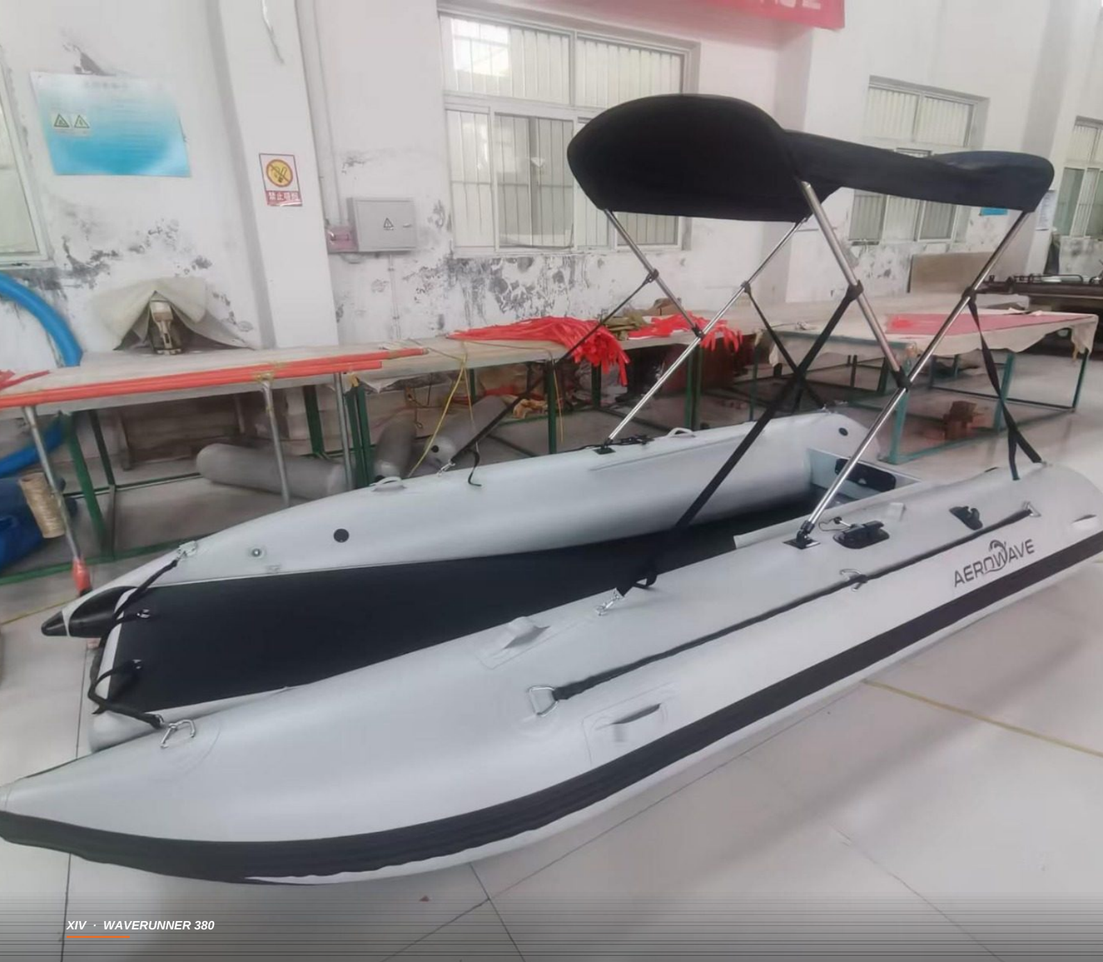
XIV - WAVERUNNER 380